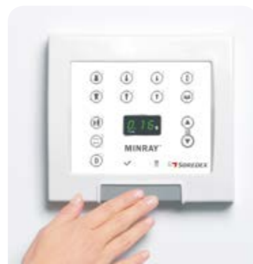
The remote mounted control panel has a specific Push-bar exposure switch.

You don't need to choose horizontal arm length in advance. The arm length will be adjusted and fixed at the time of installation in your practice and it can be readjusted later if needed. Extendable adjustment gives versatile arm reach for your practice!