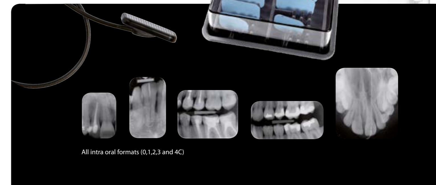
All intra oral formats (0,1,2,3 and 4C)