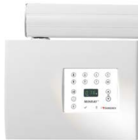
The user-friendly control panel can be installed in the wall box or be remote mounted in almost any location.