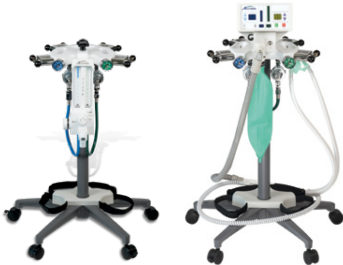
Ultra PC™ Flowmeter