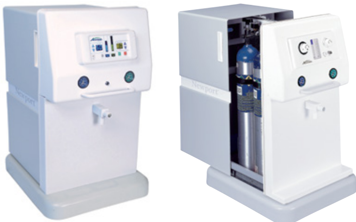
Newport™ Digital Flowmeter System