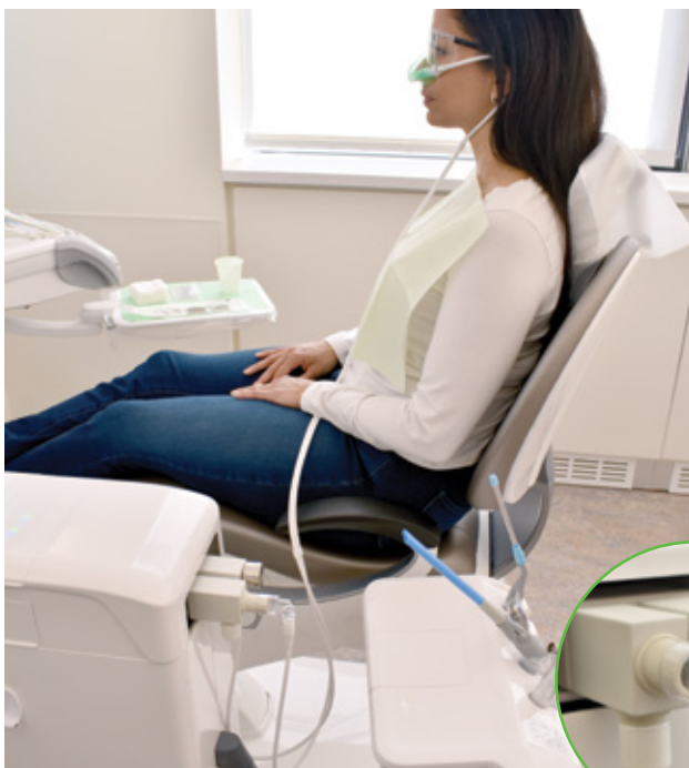
Dentsply Sirona chair shown