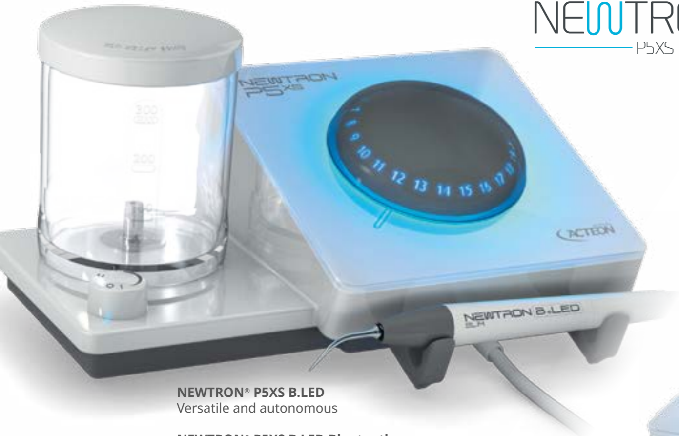
NEWTRON® P5XS B.LED Versatile and autonomous