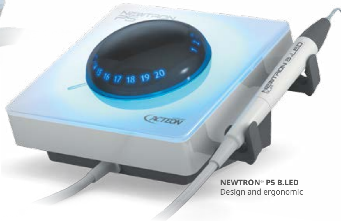
NEWTRON® P5 B.LED Design and ergonomic