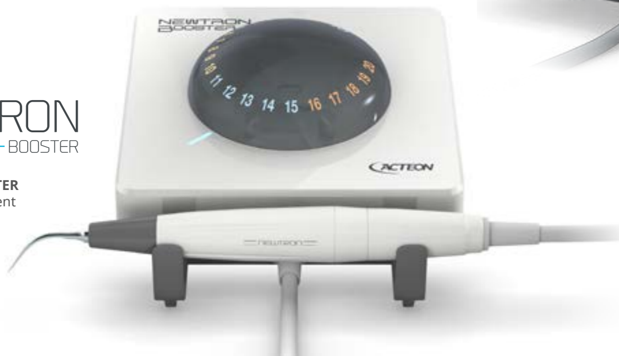
NEWTRON® BOOSTER Compact and efficient