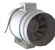
Ventilation fan kits