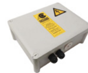
Compressor parallel connection kit